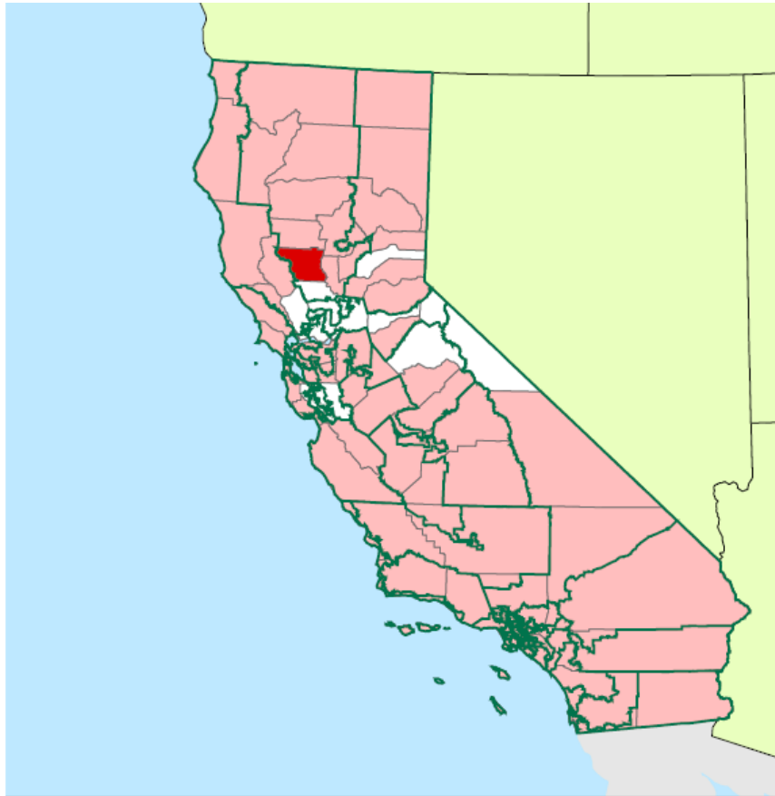
California Health Professional Shortage Areas with Family Doctors